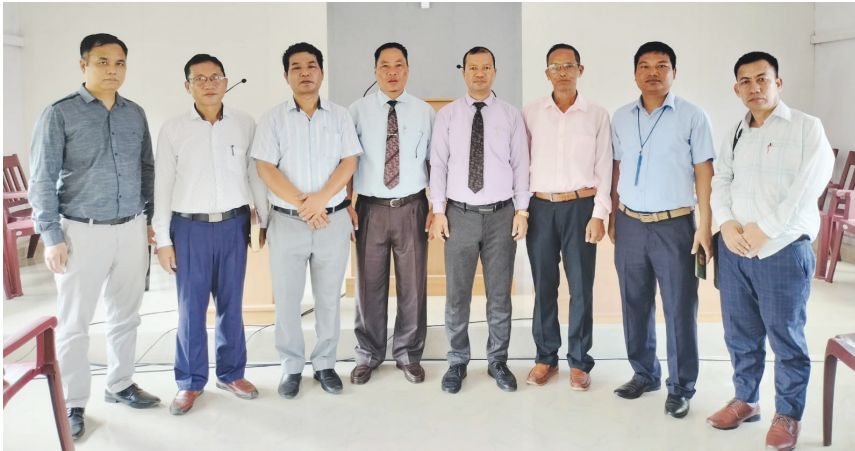
GUWAHATI PRESBYTERIAN KOCHUAM AH SEMINAR NEI NA